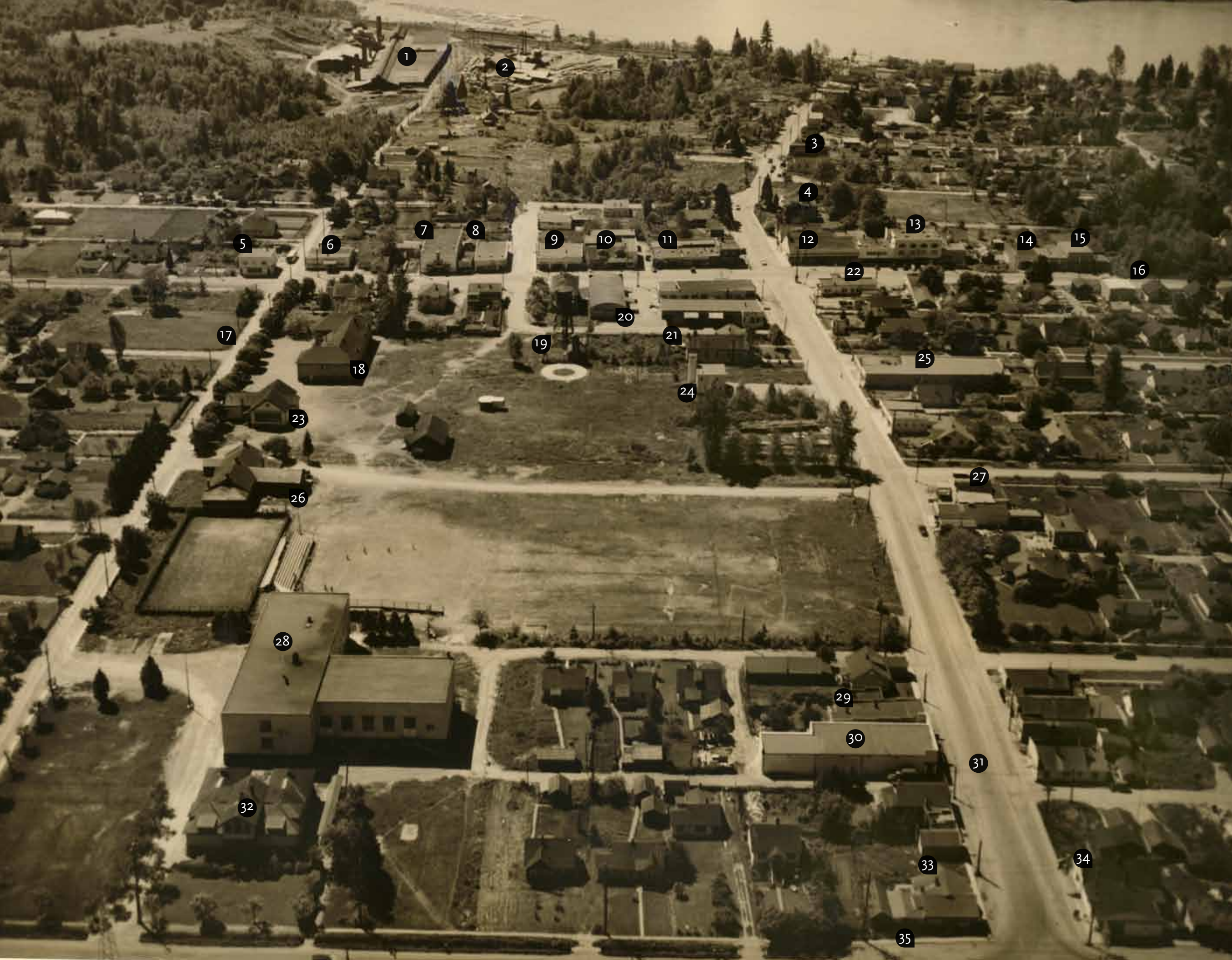
Port Haney, looking south toward the Fraser River, 1948.