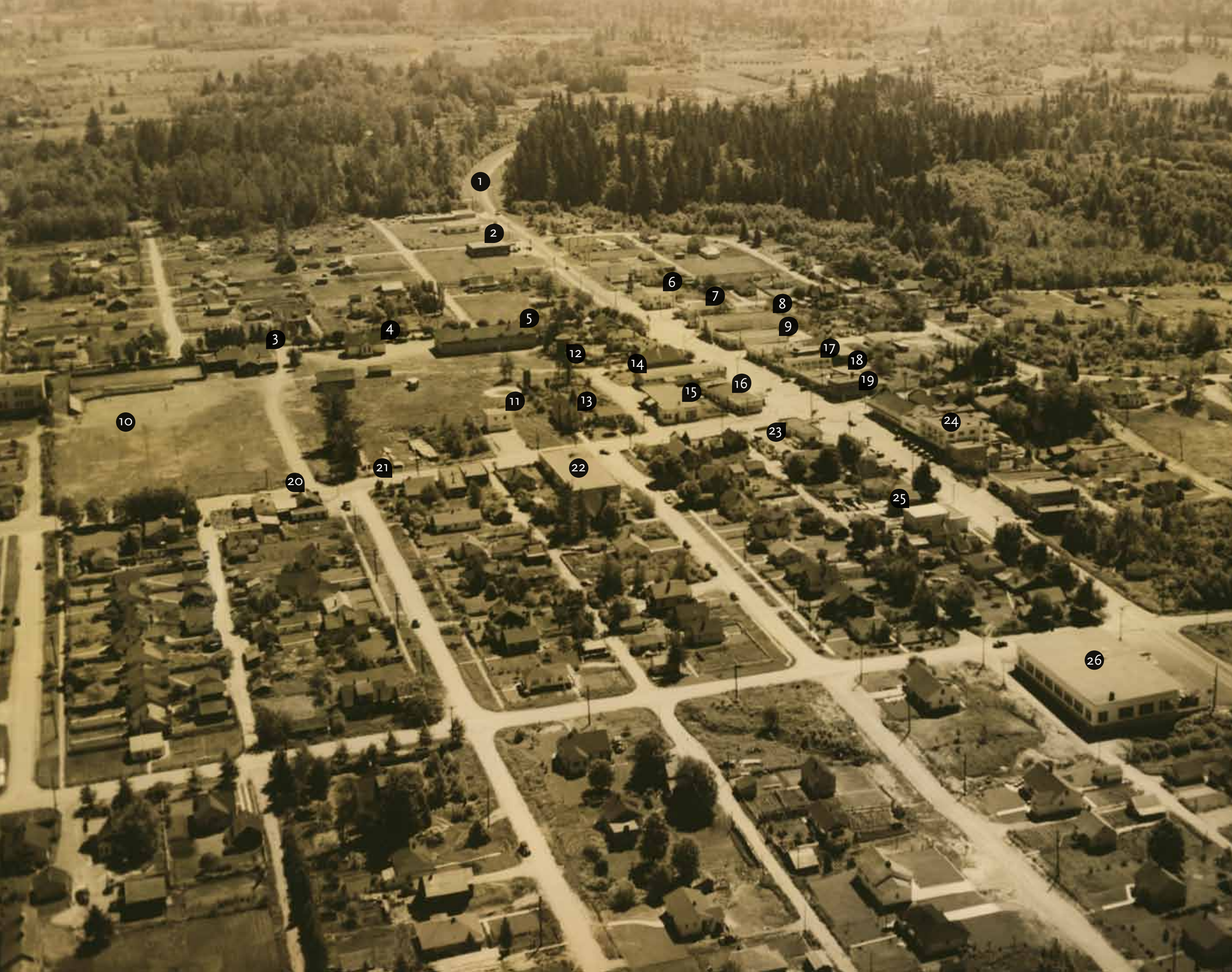
Downtown Haney looking east during the flood of 1948.